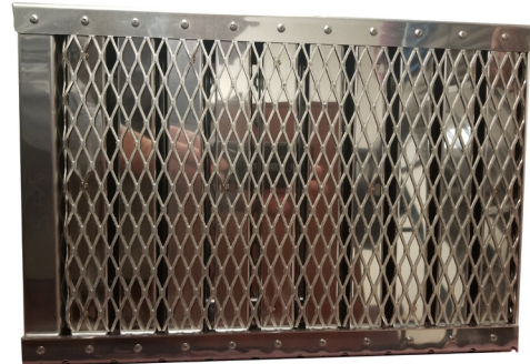
Model XGS-SPA Spark Arrestor Extractor